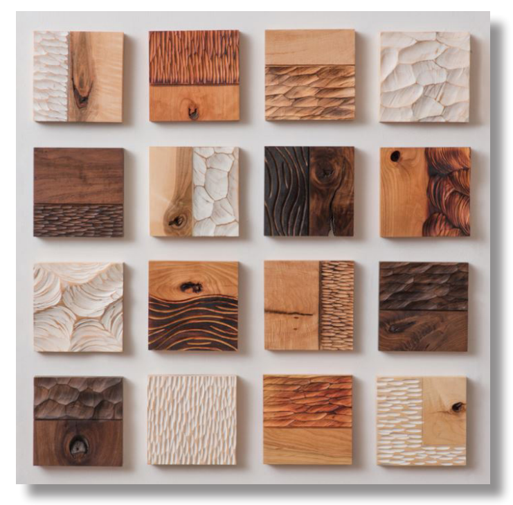
CARVED WOOD PANELS WITH PAINTED & BURNED CONTOURING APPROXIMATE OVERALL 97" X 37

The wood is often worked while it's still green then allowed to warp and crack as it dries. After carving I paint or burn the surface to emphasize tool marks. The lines and textures carved in the wood are abstractions from the natural world; rocks, water, sand, waves, trees, ice... I primarily work within squares, rectangles and grids; exploring relationships between the organic carving and the machined lines.