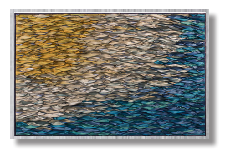
FIBER ARTWORK PANELS DIPTYCH IN SHADOW BOXES APPROXIMATE OVERALL 120" X 36"