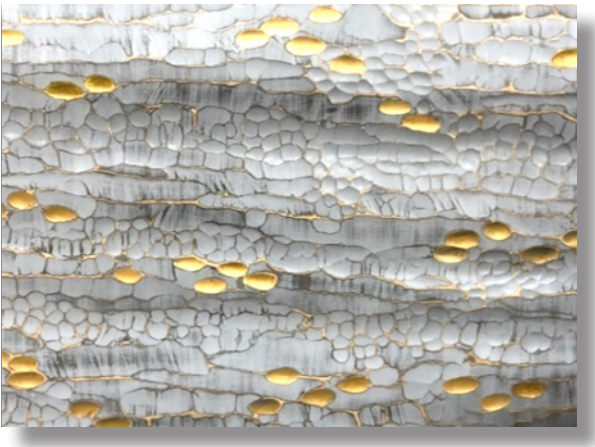
HAND CARVED WOOD PANELS WITH TEXTURED NEUTRAL AND GILDED FINISH APPROXIMATE OVERALL 80" X 30"