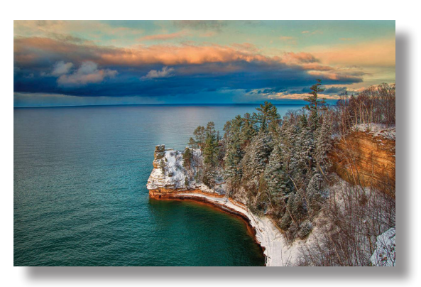
FINE ART PHOTOGRAPHY PRINTED ON VARIOUS SUBSTRATES