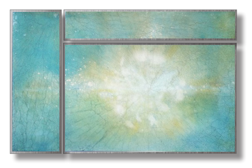
MULTI PANEL PAINTED ART GLASS APPROXIMATE OVERALL 70" X 40"