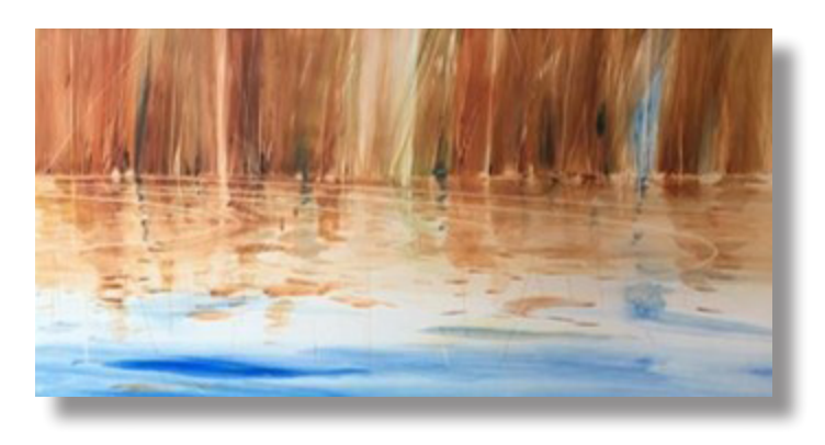
ACRYLIC PAINTING ON PANEL - DIPTYCH APPROXIMATE OVERALL 126" X 30"