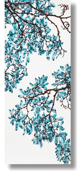
"VIVID BLUE" ACRYLIC PAINTING ON MYLAR 50" x 120"

For the last twenty-five years, I have made a living from my studio practice and am a popular motivational speaker on the challenges of sustaining a successful career in the visual arts. I am the author of The Artist's Guide: How to Make a Living Doing What You Love, Da Capo Press, 2009.