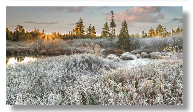
FINE ART PHOTOGRAPHY PRINTED ON VARIOUS SUBSTRATES