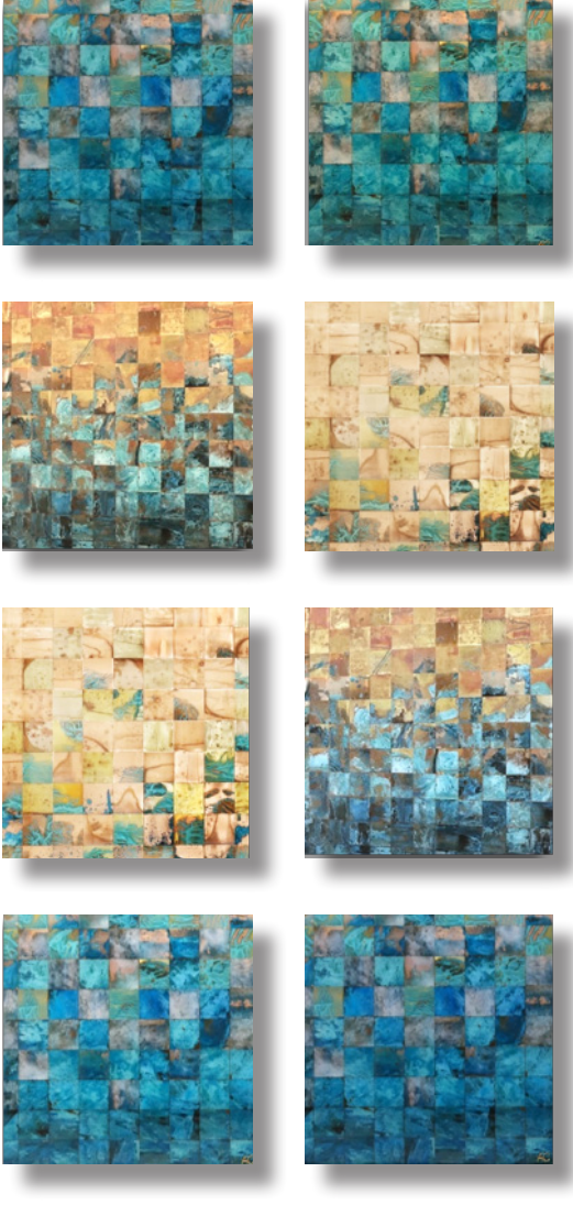
COPPER PATENA SCULPTURES QUANTITY OF 8 APPROXIMATELY 36" X 36" EACH

My compositions draw on the properties of copper to create colour, texture, and shape. I use chemical and thermal techniques to transform the material from its natural state to an array of unexpected finishes.