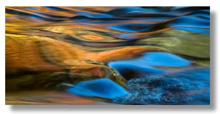
FINE ART PHOTOGRAPHY PRINTED ON VARIOUS SUBSTRATES