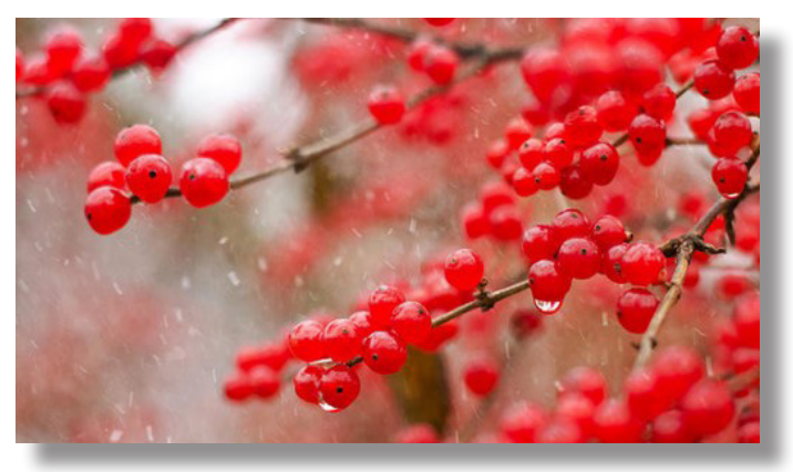
FINE ART PHOTOGRAPHY PRINTED ON VARIOUS SUBSTRATES