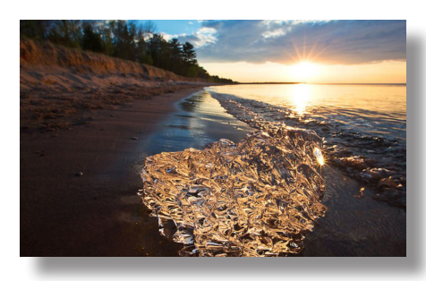
FINE ART PHOTOGRAPHY PRINTED ON VARIOUS SUBSTRATES