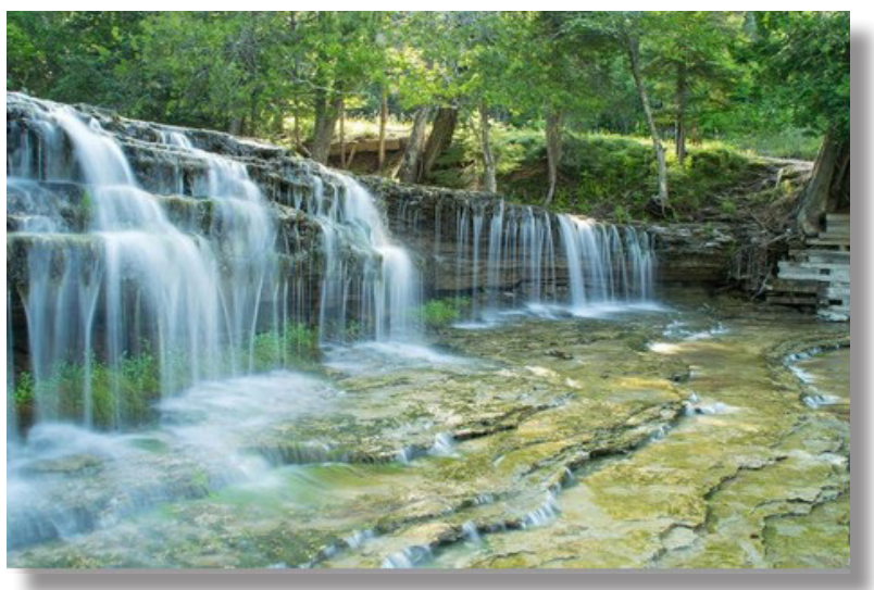
FINE ART PHOTOGRAPHY PRINTED ON VARIOUS SUBSTRATES