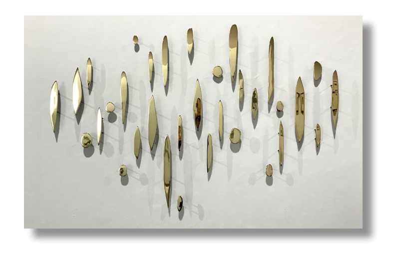
WALL MOUNTED, GOLD PLATED, STEEL COMPONENTS APPROXIMATE OVERALL 60" X 40" | 33 Pieces

Wall compositions are separated from the surface of the walls with a distance of one or two inches, creating a floating effect in the space that is enhanced by lights and shadows. The blank walls become the medium and support for each one of these installations. The free standing and hanging pieces use the void as the main visual element. Space it's a medium and transparency it's always an important factor in these pieces.