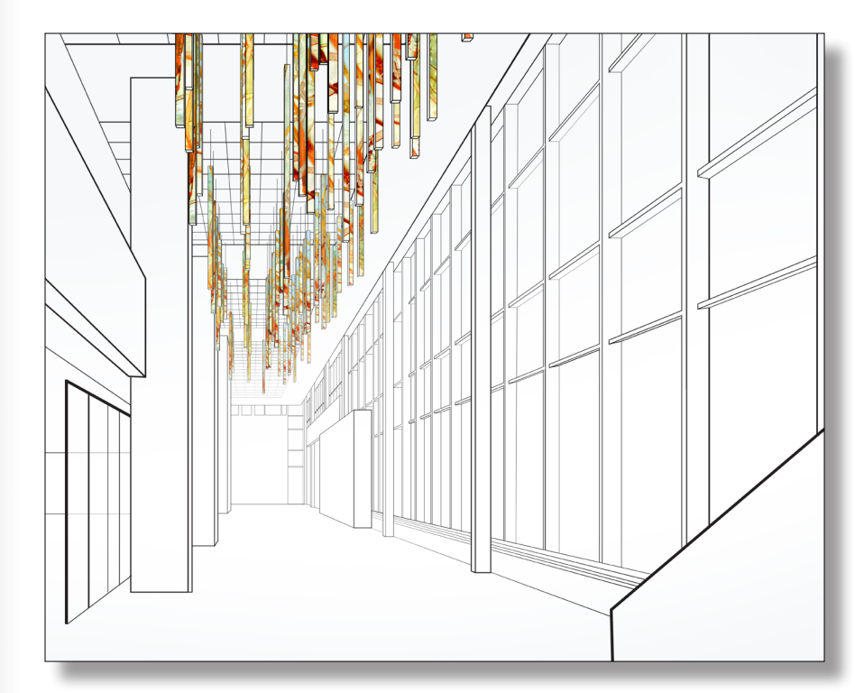
CUSTOM ARRANGEMENT OF SUSPENDED ACRYLIC ICICLES OVERALL FOOTPRINT: 111 ICICLES TOTAL

My experience as a painter and printer of monotypes and monoprints has informed my non-traditional approach to using layered imagery digitally. It has felt like a logical transition, one I had spent years preparing for without even knowing it. Creating art digitally has opened up new opportunities for working on translucent substrates. The role of light, both transmitted and reflected, on glass and acrylic created another welcome artistic experience. The magical effect of light changes the art on these substrates throughout the day in every environment. Equally important has been the issue of scale. To produce art that can be scaled up to very large proportions is something an artist working on paper or canvas could never do. Similarly, the capacity to crop out sections of an artwork has allowed me to see composition in a new way. The parts that make up the whole are often as interesting as the original piece.