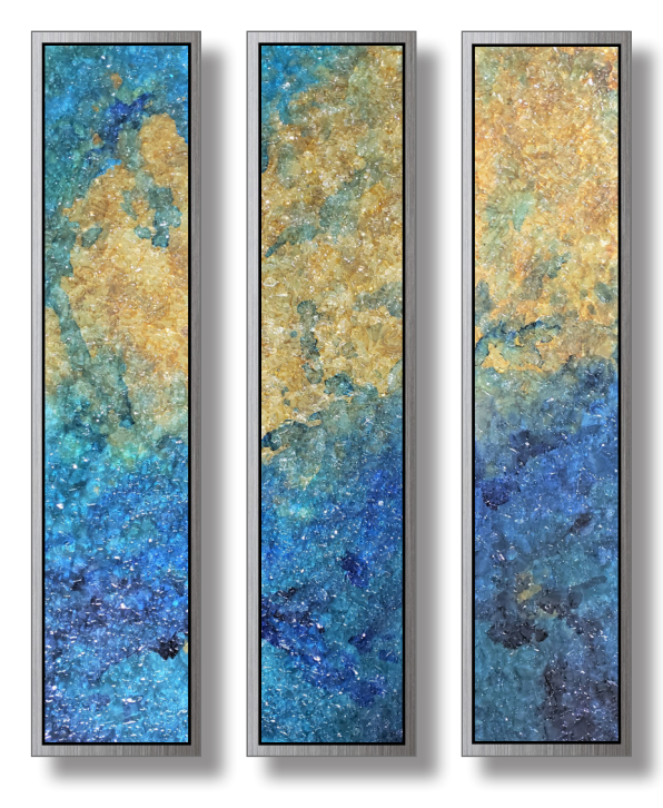
"ASCENSION" ECO ART GLASS PANELS FLOAT FRAMED APPROXIMATE OVERALL 36" X 48"

In other words, I want the viewer to fall in love with the beauty of the object first. A certain optimism is conveyed when the viewer learns it was resurrected from rubbish. This optimism is what my work is all about. It's never too late for anything (or anyone) to be remade.