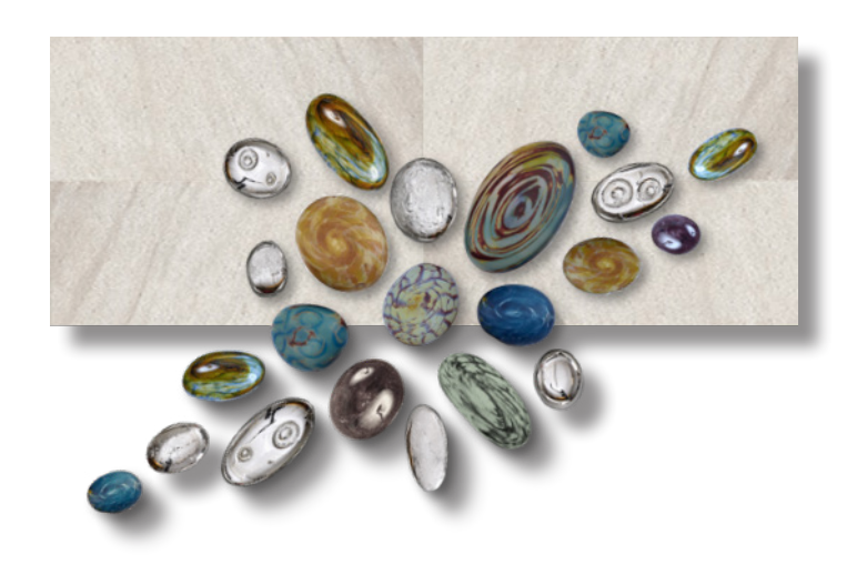
BLOWN GLASS STONES APPROXIMATE OVERALL 168" X 96"

We began working together fifteen years ago after meeting at Pilchuck Glass School in Stanwood, Washington. After completing a three -year residency at Penland School of Crafts in the mountains of North Carolina we settled nearby and set up our studio where we continue to find inspiration in the natural beauty that surrounds us.