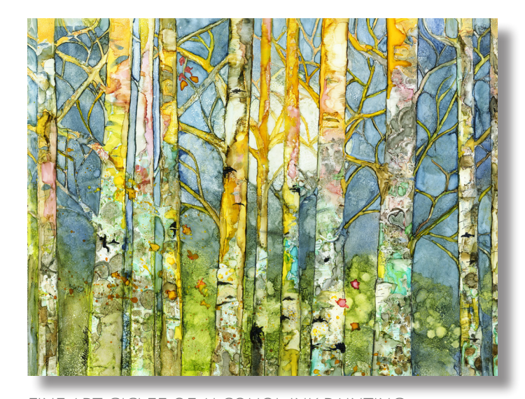
FINE ART GICLEE OF ALCOHOL INK PAINTING

The inspiration for my art comes from the fabulous nature that surrounds me. I feel beyond lucky to live in the Upper Peninsula, seeing Lake Superior in all of it's splendor right outside of my studio window. I also am inspired by the peaceful, quiet time at camp and being off the grid. I don't want to make a photographic representation of my inspiration; rather I strive to visually show a feeling of the environment I'm experiencing at the moment.