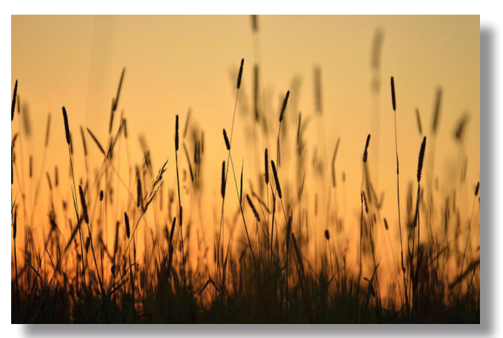
FINE ART PHOTOGRAPHY PRINTED ON VARIOUS SUBSTRATES