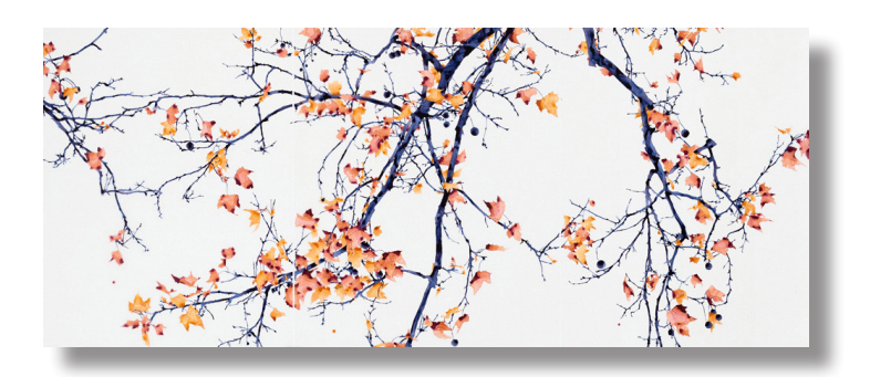
"LONG INDIAN SUMMER" ACRYLIC PAINTING ON MYLAR 120" x 50"