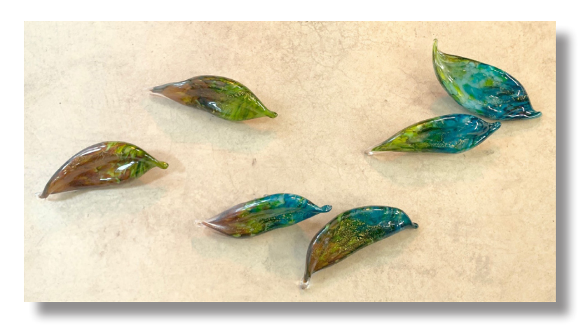
BLOWN GLASS SCULPTURE APPROXIMATE OVERALL 120" X 36"

Her work is part of art collections at Kaiser Permanente, Marriott, California Bank & Trust, Novartis, Sharp Medical Center, Rady Children's Hospital, City of Vista Civic Center, Westwood Medical Plaza, Professional Hospital Supply, Inc., L'Auberge Del Mar, Aveda, and Vistage as well as other public & private collections worldwide.