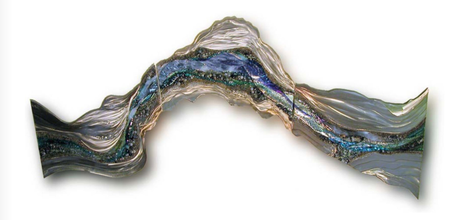
"HEALTHY FLOW" KILN FORMED GLASS AND STEEL WALL SCULPTURE APPROXIMATE OVERALL 200" X 36"