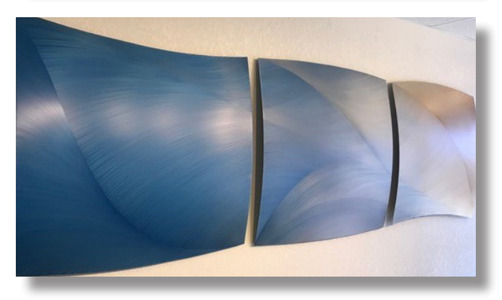
OIL BURNISHED, AIRCRAFT ALUMINUM PANELS QUANTITY OF 3 APPROXIMATELY 36" X 36" X 2" EACH